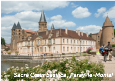
Sacré Cœur basilica, Paray-le-Monial