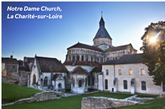
Notre Dame Church, La Charité-sur-Loire

Market: Sat (am) in La Charité-sur-Loire.