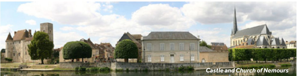
Castle and Church of Nemours