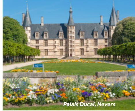
Palais Ducal, Nevers

Amenities: Bakery, 1.5 km from the mooring.