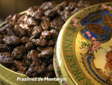
Praslines de Montargis