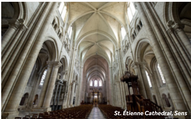
St. Étienne Cathedral, Sens