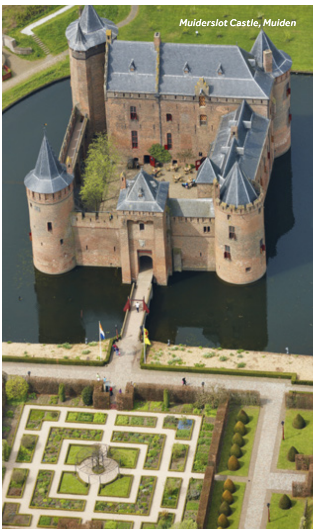
Muiderslot Castle, Muiden