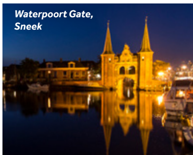
Waterpoort Gate, Sneek

Sneek is Friesland's most famous water sports town. Every year in August, there is a large sailing regatta on the lake and all kinds of activities in the town. A visit to the famous 'Waterpoort', the only of its kind and remaining form the 17th century town walls, should not be missed when you are here. The maritime museum gives you a glimpse into the city's nautical past and also has a beautiful collection of Frisian silver. And for children, the model train museum is also very nice to visit. The town is also known for its regional speciality, Beerenburg, a herb-flavoured gin which used to be a medicine in the past. You can taste and buy beerenburg in the original and authentic Weduwe Joustra shop.