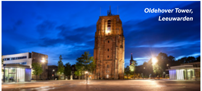
Oldehover Tower, Leeuwarden