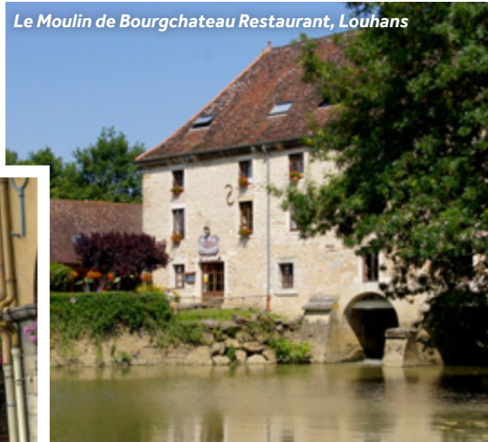
Le Moulin de Bourchateau Restaurant, Louhans

Waterside services: Port: water, electricity, Wi-Fi.