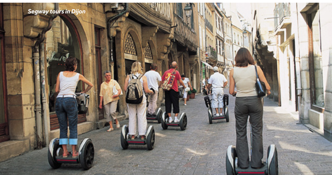
Segway tours in Dijon

Waterside services: The marina here has water, electricity, toilets, showers, launderette, Wi-Fi.