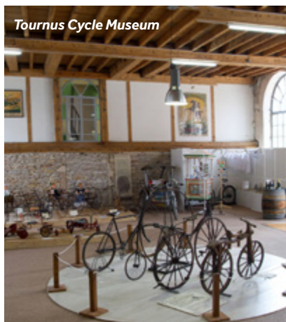
Tournus Cycle Museum