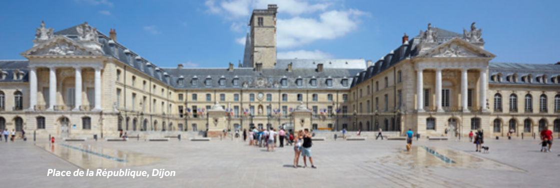
Place de la République, Dijon