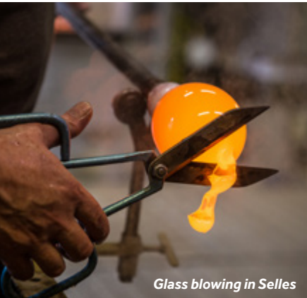
Glass blowing in Selles

Waterside services: The Le Boat base has Wi-Fi, water, electricity, as well as showers/toilets when the base is open.