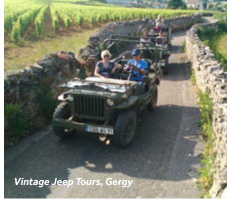
Vintage Jeep Tours, Gergy

Amenities: Small supermarket, bakery, butcher and café.