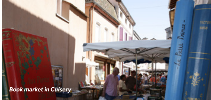
Book market in Cuisery