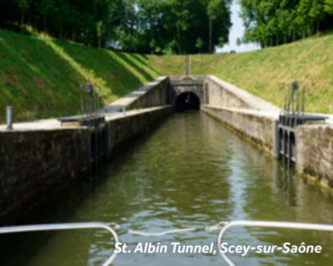
St. Albin Tunnel, Scey-sur-Saône