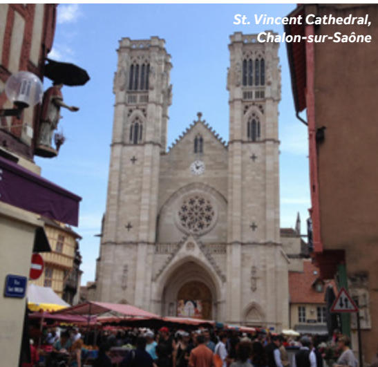
St. Vincent Cathedral, Chalon-sur-Saône