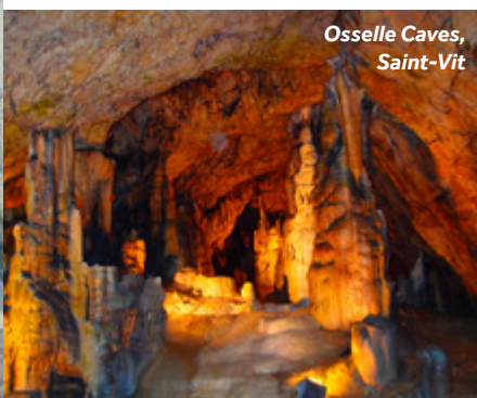
Osselle Caves, Saint-Vit

Amenities: Supermarket, bakery, butcher, cafés and restaurants.