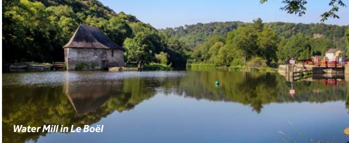
Water Mill in Le Boël

Waterside facilities: Marina: water, electricity, Wi-Fi, toilets, showers