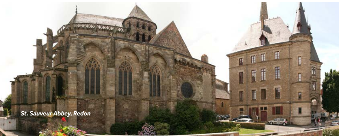
St. Sauveur Abbey, Redon

Waterside facilities: Marina: water, electricity, toilets, showers