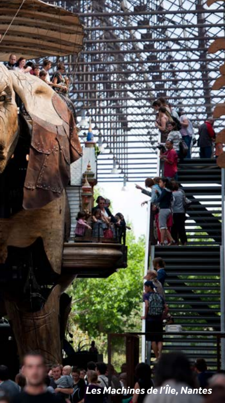
Les Machines de l'Île, Nantes