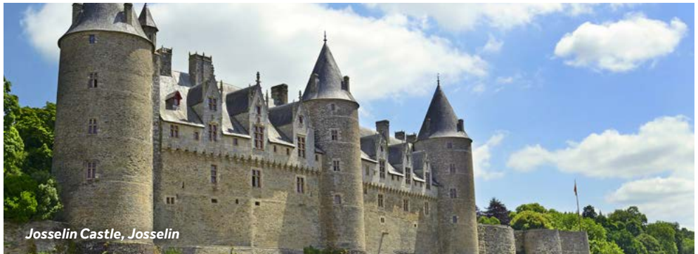
Josselin Castle, Josselin

Waterside facilities: Marina: water, electricity