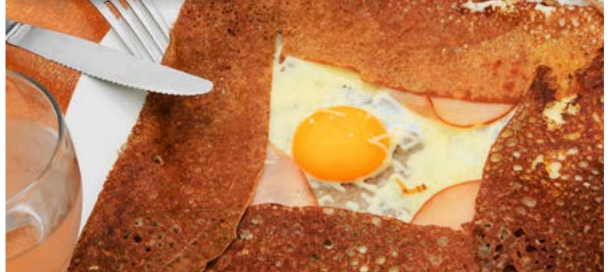
Enjoy a crêpe in Nantes

Waterside facilities: Marina: water, electricity, toilets, showers, wifi.