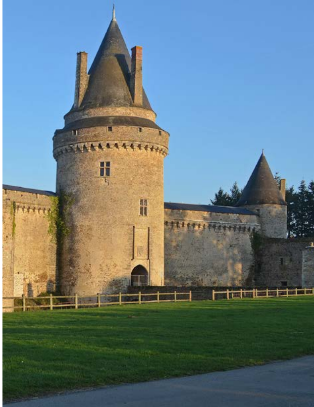
Groulais Castle, Blain

Waterside facilities: Marina: water, electricity, toilets, showers