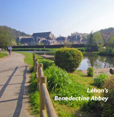
Léhon's Benedictine Abbey